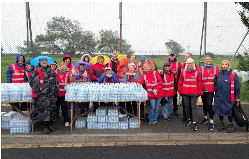
10 th Hole Water Station Volunteers